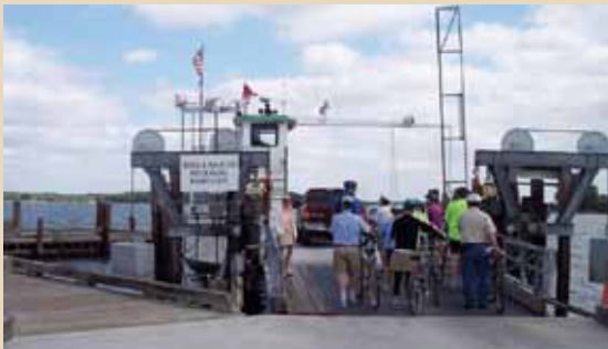
The Oxford Bellevue Ferry